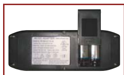
Battery Backup System

In the event of a malfunction, our patented SmartTek™ diagnostic system enables you to get your lift chair up and running quickly.