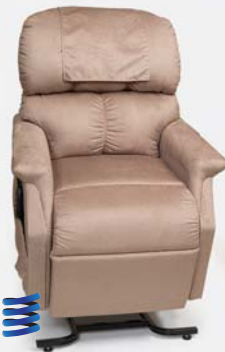
Comforter Small PR-501S