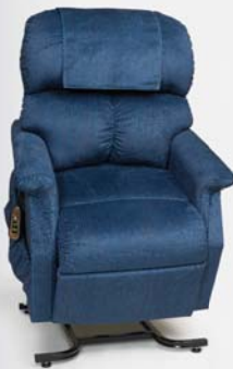
Comforter Junior Petite PR-501JP