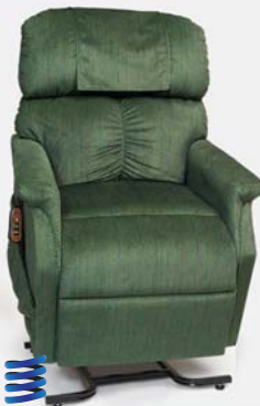
Comforter Large PR-501L