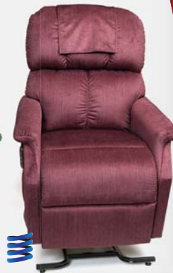
Comforter Tall PR-501T