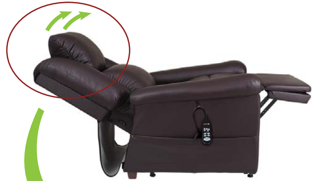
Power Articulation Head Forward