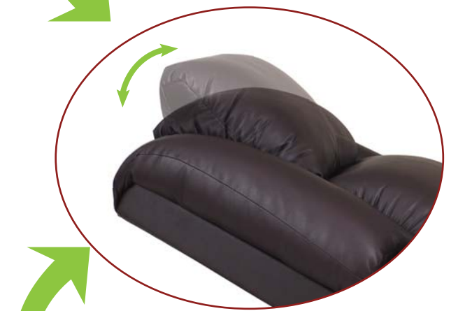
Power Articulation Head