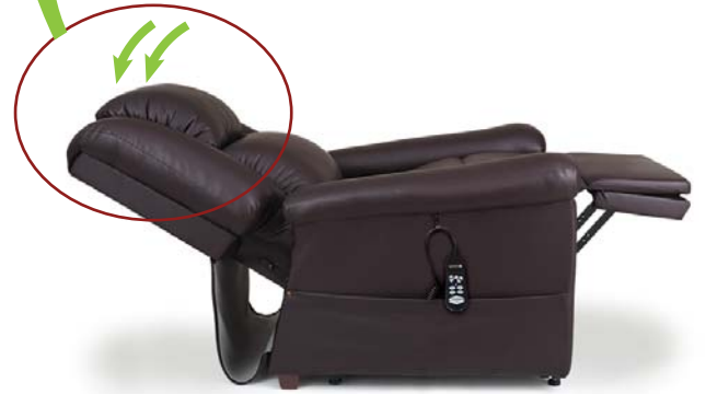
Power Articulation Head Back